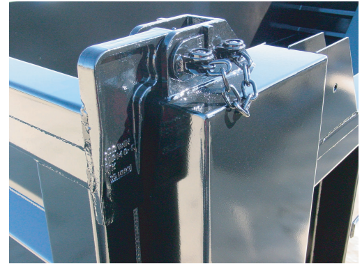
Tailgate hardware is cast steel with grease fittings.

Air tailgate latch, 36" cab shield, 8 gauge sides, 1/4" floor, sloping tailgate, air latch barn door tailgate.