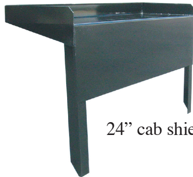
24" cab shield

All Godwin bodies are constructed of 10 gauge ASTM-A 607 grade 50 material or equal to ensure durability and long life. Godwin leads the industry with standard thermoset Zinc primer under black thermoset Powder coating. A 24" cab shield is standard equipment on the 400T and 500TR.