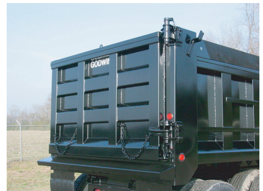
Optional air barn door with asphalt lip shown.