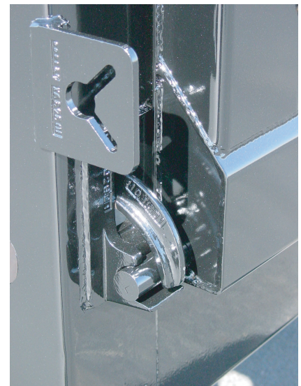
Lower tailgate latch is 4140 grade cast steel. Latch pivots are bushing type width 1 1/4" diameter pin for extra support.