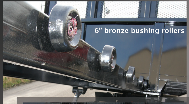
6" bronze bushing rollers