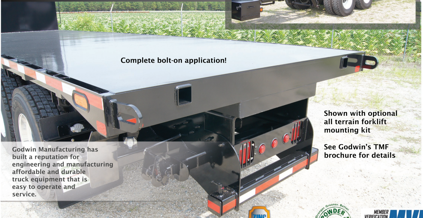
Complete bolt-on application!

Shown with optional all terrain forklift mounting kit